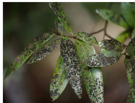
Image 1. Sooty mould aggregation on leaf and fruit tissue

Egg laying typically occurs during autumn. L. delicatula will 'over-winter' at the egg stage and first instar nymphs emerge as early as the following mid-spring. Nymphs continue development through the instars and feed on host plants over spring and summer. Adults may be seen as early as autumn and may survive for up to four months, during which time they will mate and lay eggs (Image 3).