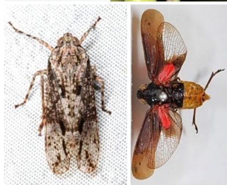
Image 9. Rentinus dilatatus (Found in ACT, WA, VIC, SA, NSW, QLD, TAS)