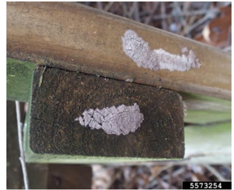
Image 13. Lycorma delicatula will lay eggs on a variety of surfaces, including inanimate objects. This poses a major transmission risk.

For southern Australia, nymph emergence is predicted to occur from November with adults evident in most regions by March. By April, survival is estimated to be highest in southern coastal regions. In Tasmania, nymph emergence is not predicted to occur in many western areas where temperatures remain too cool.