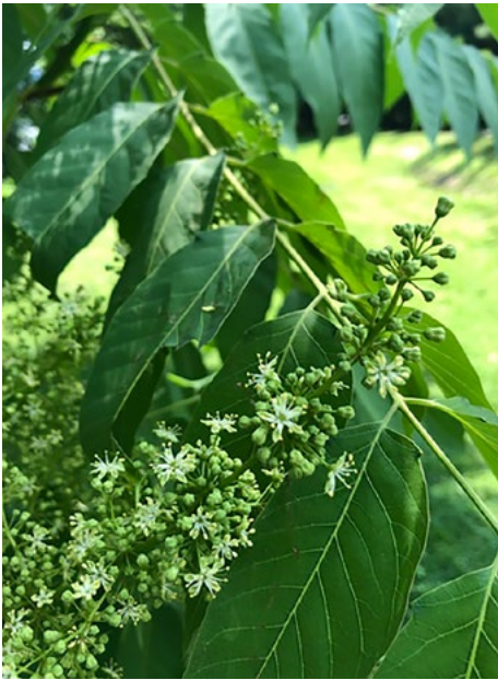
Image 8. A. altissima (the Tree of Heaven) is a naturalised invasive species often found in urban areas that is a preferred host of L. delicatula

Monitoring local A. altissima plants (Image 8) is a useful strategy as it is a highly preferred host (this tree is also preferred by another priority exotic pest, the brown marmorated stink bug ( Halyomorpha halys )).